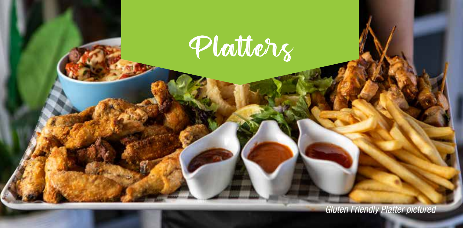
Gluten Friendly Platter pictured