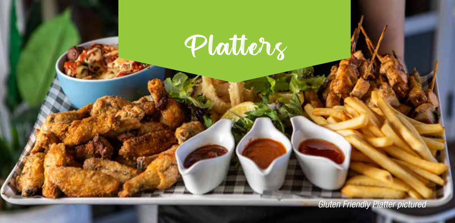
Gluten Friendly Platter pictured