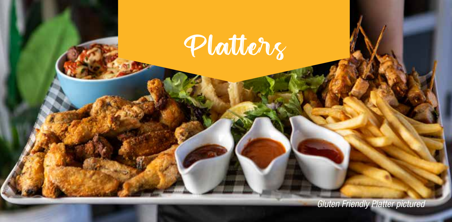
Gluten Friendly Platter pictured